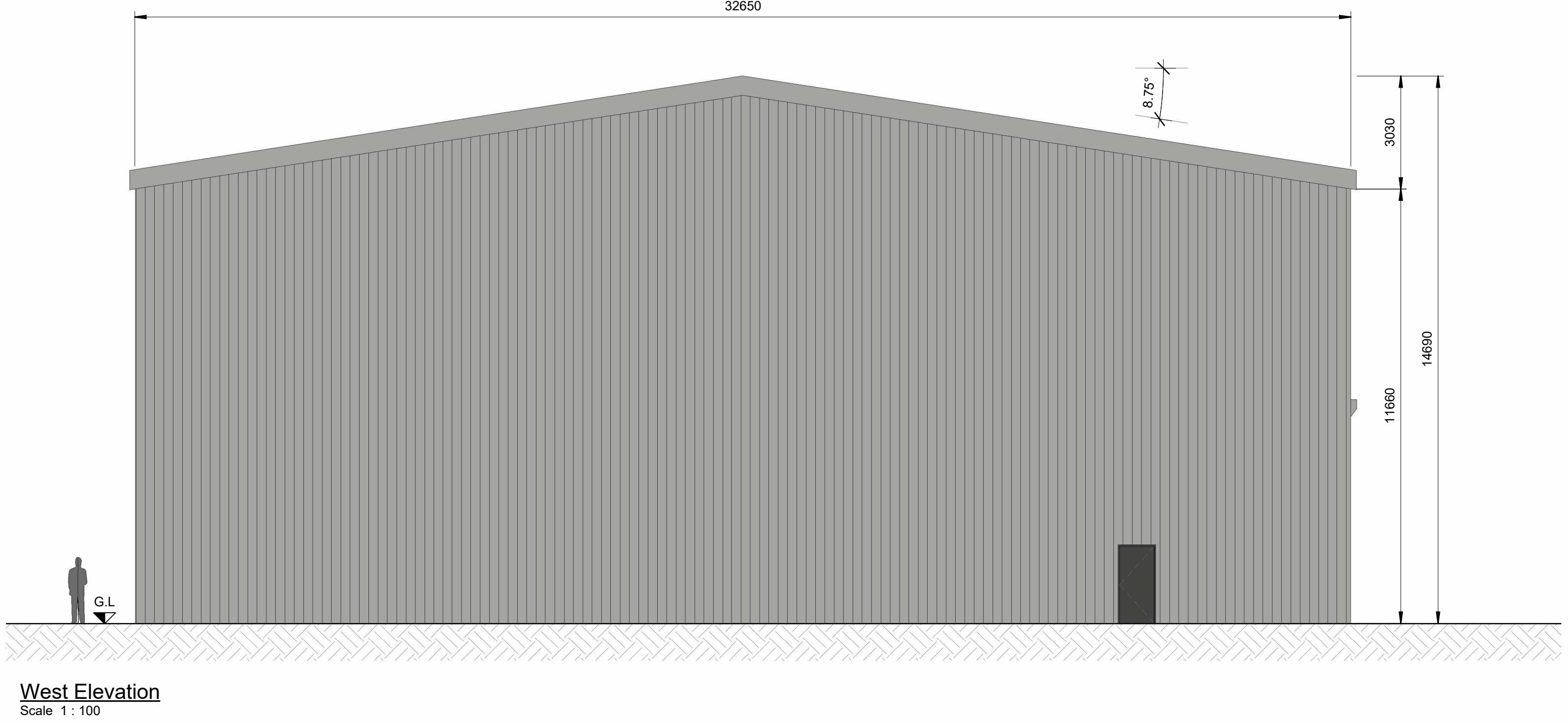
West Elevation Scale 1 : 100