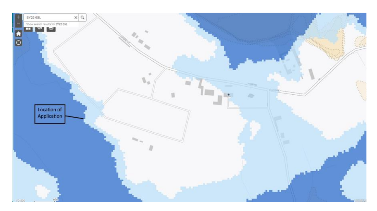
(NRW detailed flood map showing River and Sea Water Flooding)