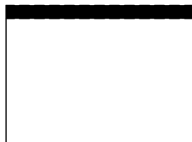
Office Elevation C