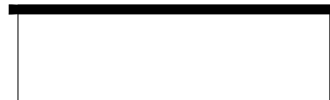
Office Elevation D