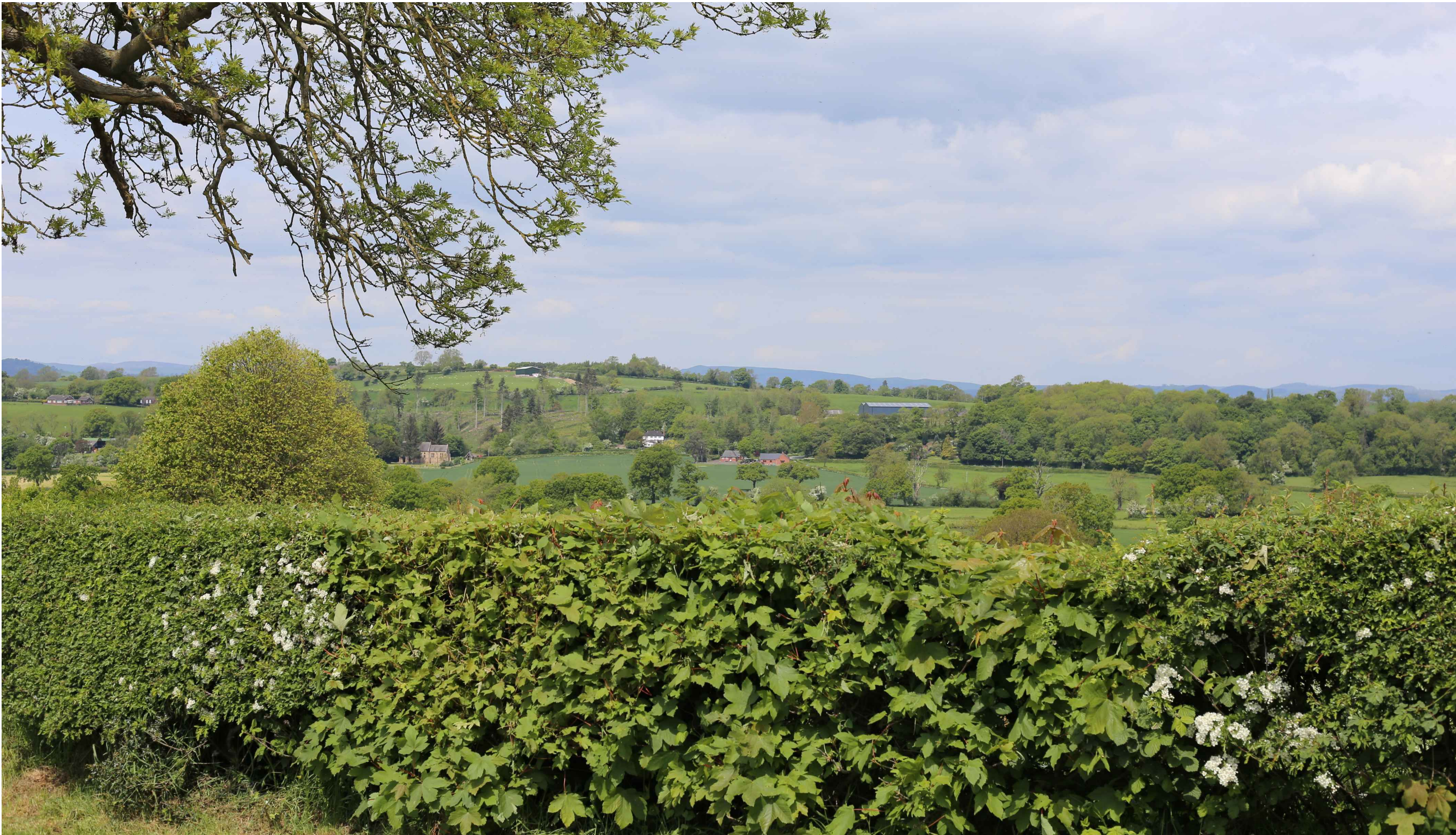
Existing View – View North