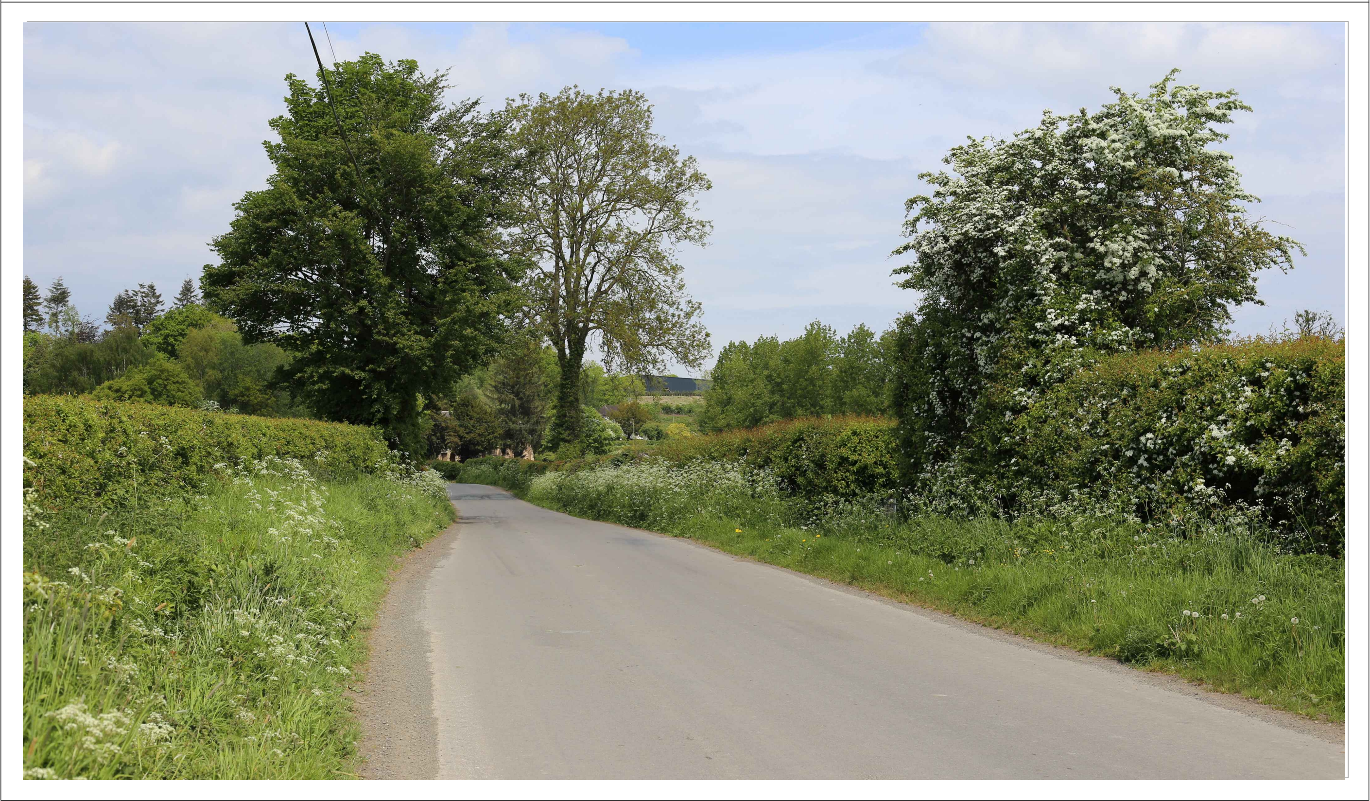
Existing View – View Northeast