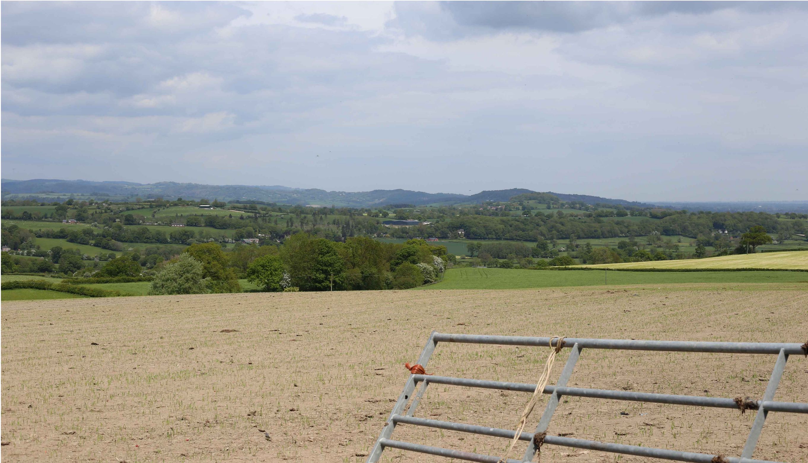
Existing View – View Northeast