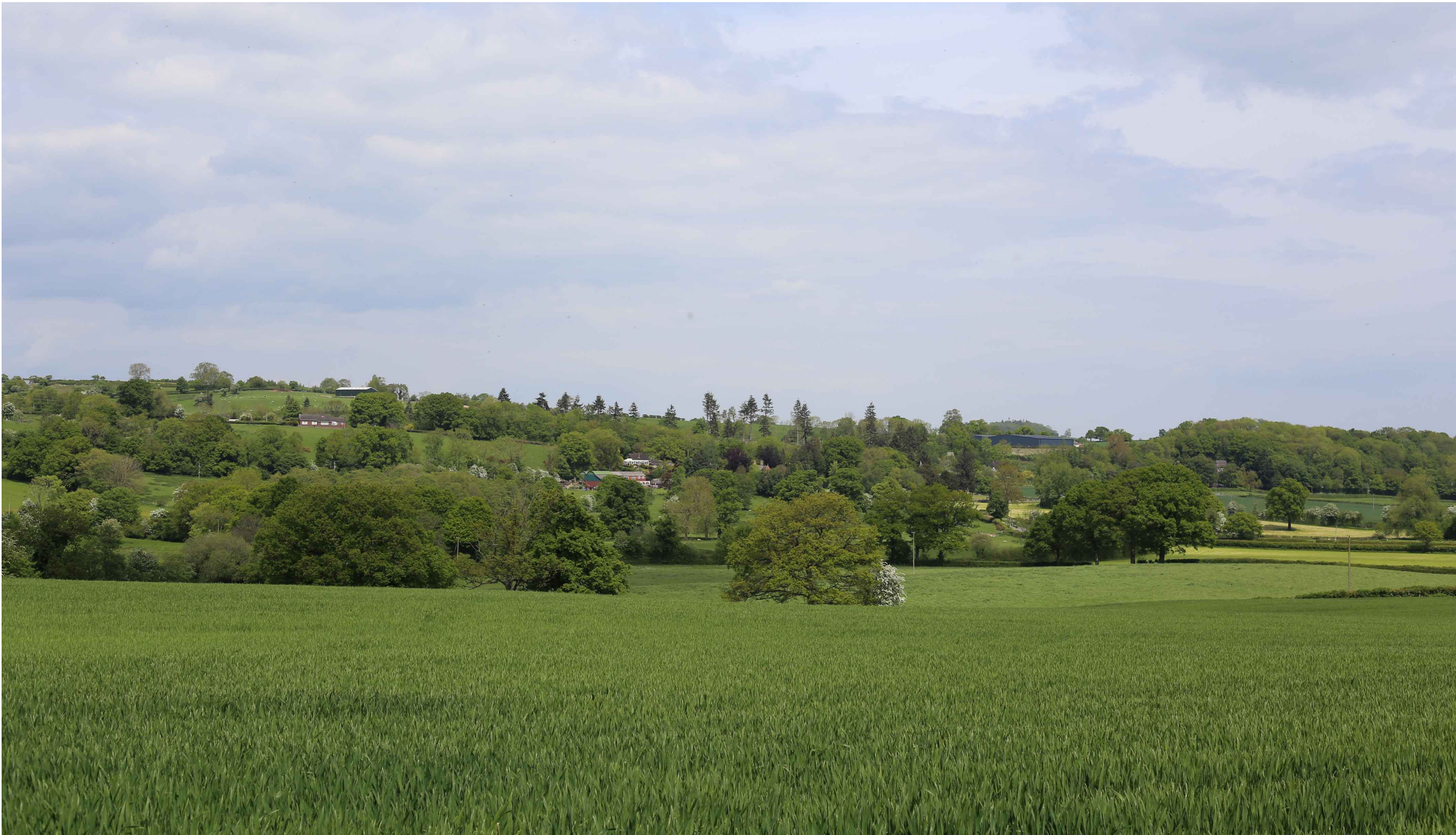
Existing View – View Northeast